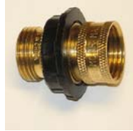
Quick Connect AS20126