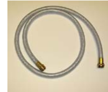
6 ft. Reinforced PVC Hose - AS20128