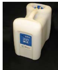
Transport Container: Multisurface Concentrate AT20046

Note: Order Connection Kit AS20035 (MM) / Connection Kit AS20036 (MSC) to connect to os3 filler transport containers