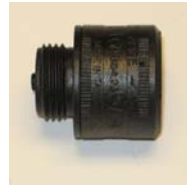
Back Flow Preventer AS20127