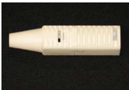
Spray Nozzle AS20125