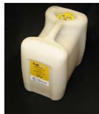
Transport Container: Multimicro Concentrate AT20045